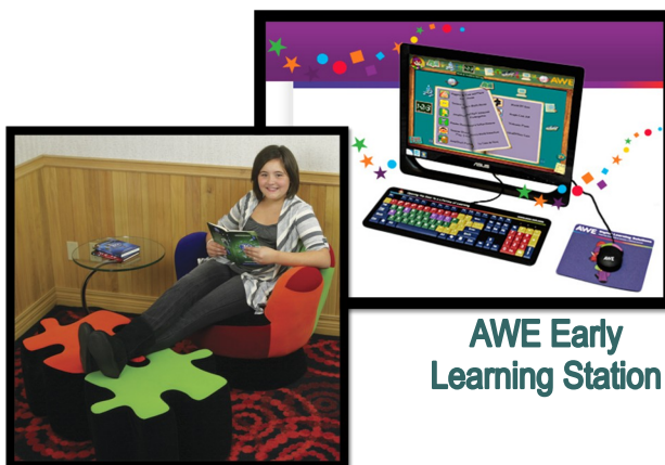
AWE Early Learning Station