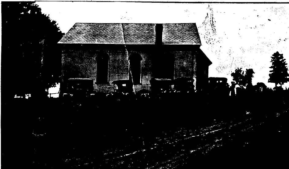
THE CHURCH AS IT APPEARED - CIRCA 1920